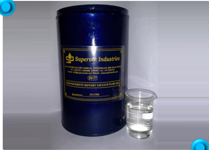
Image : Supervac's Premium Quality Synthetic Rotary Vacuum Pump Oil SV-77

Initially, they were wary of using an indigenous oil for their German machine. As it was a critical item; and the failure of the rotary pump could stall their entire process. They needed an oil that fitted all the parameters set by the manufacturer as well as cost effective. So, on our sales team suggestion, they sent a small sample of their ours and german oil to an independent laboratory of repute to test the quality standards. As an alternative to the german oil, SV-77 not only matched all the standards layed down by rotary pump oil manufacturer but performed better on some of them.